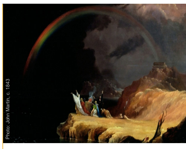
"I have set my rainbow in the clouds, and it will be the sign of the covenant between me and the earth."

The rainbow is a sign of human weakness, but more so a sign that, despite our failings, God still believes in us. It is a symbol of how far we have fallen, but also a symbol of hope for how great we are yet to become. With its seven colors, it is also a reminder of the seven directives given to all humankind so that we can create the just and moral society that God intended for our world.