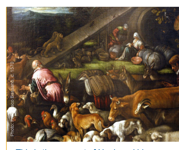
This is the account of Noah and his family. Noah was a righteous man, blameless among the people of his time, and he walked faithfully with God.

Noah had an unbreakable bond with God and an unwavering faith in Him. For that. Noah was chosen—chosen to enter into covenant with God, chosen to create a world founded upon righteousness, justice, and morality.