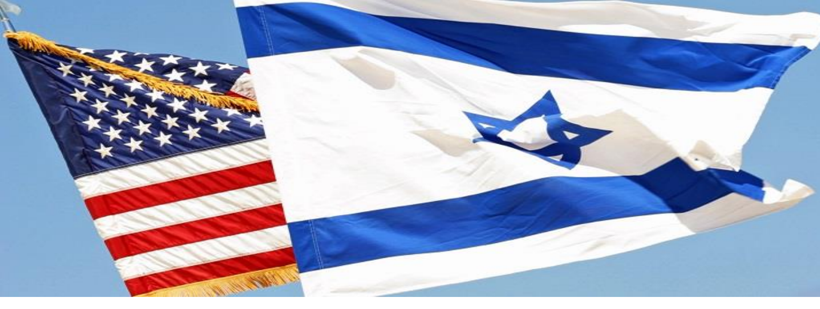
Fellowship Crossword Puzzle – Independence Day