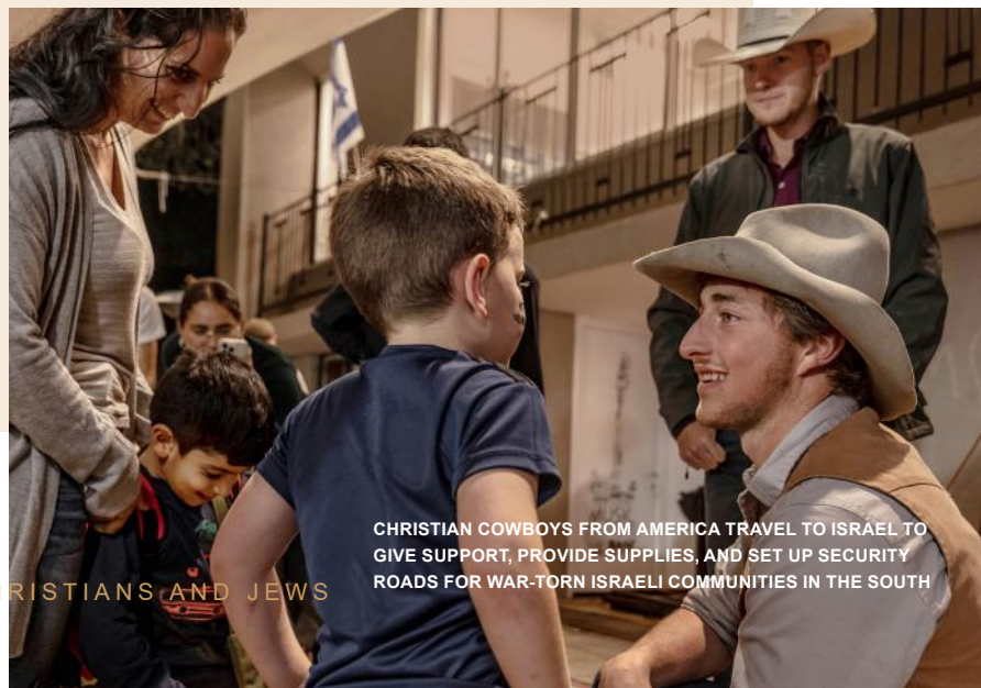
CHRISTIAN COWBOYS FROM AMERICA TRAVEL TO ISRAEL TO GIVE SUPPORT, PROVIDE SUPPLIES, AND SET UP SECURITY ROADS FOR WAR-TORN ISRAELI COMMUNITIES IN THE SOUTH

So we thank you for your support during " such a time as this " (Esther 4:14), and for being a part of a fellowship in faith that impacts so many!