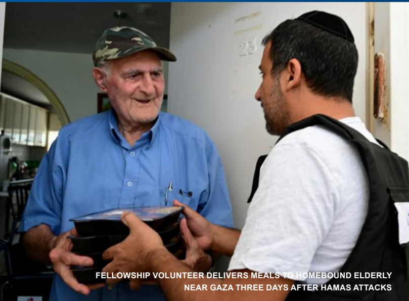
FELLOWSHIP VOLUNTEER DELIVERS MEALS TO HOMEBOUND ELDERLY NEAR GAZA THREE DAYS AFTER HAMAS ATTACKS