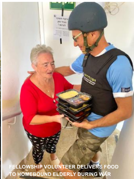
FELLOWSHIP VOLUNTEER DELIVERS FOOD TO HOMEBOUND ELDERLY DURING WAR