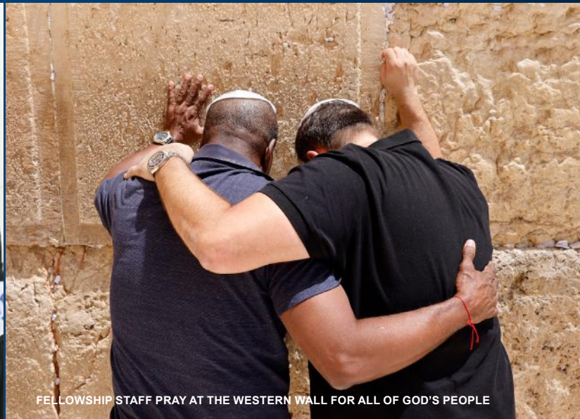
FELLOWSHIP STAFF PRAY AT THE WESTERN WALL FOR ALL OF GOD'S PEOPLE