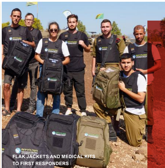
FLAK JACKETS AND MEDICAL KITS TO FIRST RESPONDERS

“I just want you to see these beautiful volunteers who just came from all over Israel to assist and help the citizens and soldiers here in the south. Look what they are going to get for the ambulance: medic bags and doctor bags from your support. You’re going to save life tonight. This is what you’re going to do. Thank you so much.”