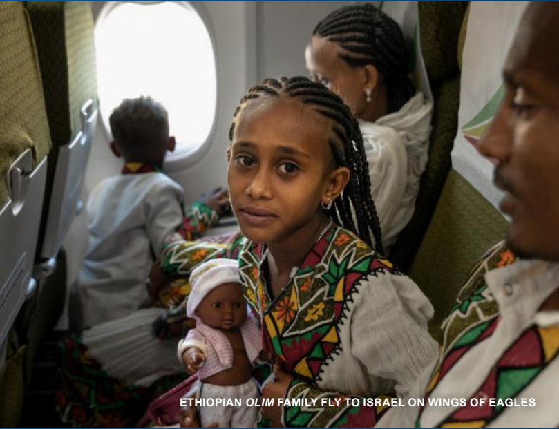
ETHIOPIAN OLIM FAMILY FLY TO ISRAEL ON WINGS OF EAGLES